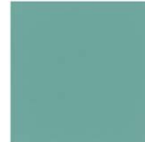
Teal 865 Gray.....60.8