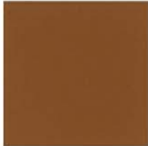
Tile Red 895 SRI.....29.2